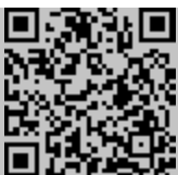
Photo Count: 13