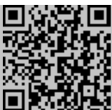
Photo Count: 34