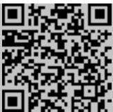
Photo Count: 5