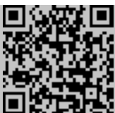
Photo Count: 30