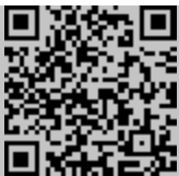
Photo Count: 25