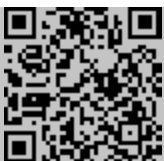
Photo Count: 17